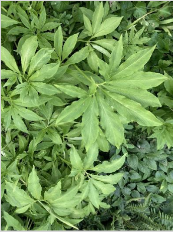
Note the five to several "fingers" of each separate leaf.

Plant in a low moist area where it can be allowed to run freely without harming other garden plants.