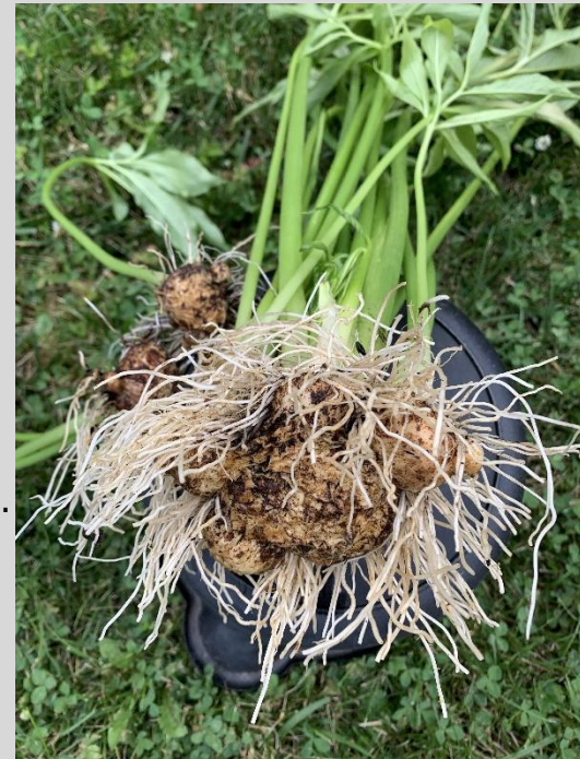
On the right are the bottoms of Green Dragon roots exposing multiple bulb-like corms which quickly expand to crowd out adjacent desirable garden plants.