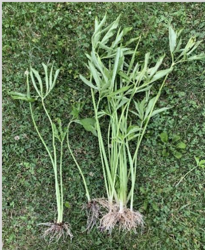
On the left are Green Dragon whole plants with roots.