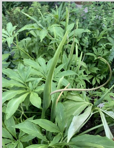
Note the extension from the base of the spadix resembling a serpent's tongue, thus the name Green Dragon.